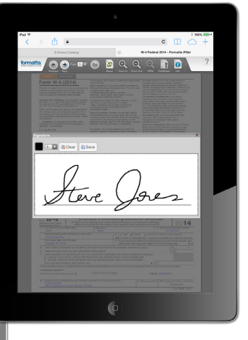
Interact seamlessly with forms using your web browser, iPad, iPhone, Android devices and other tablets.